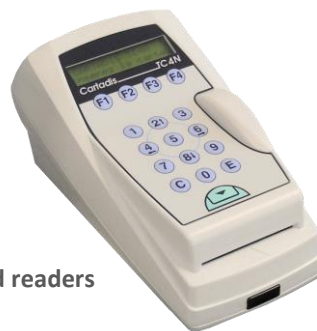
TC4N/TC11N/TCRS magnetic card readers

It enables the Cartadis disposable paper magnetic cards and loaded to be sold.