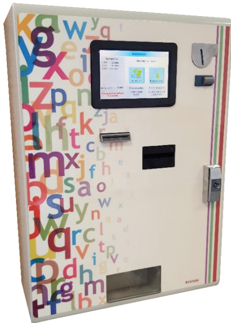
CD6/CD7 Wall version

Automatic dispenser of any paper or plastic cards in ISO7816 format